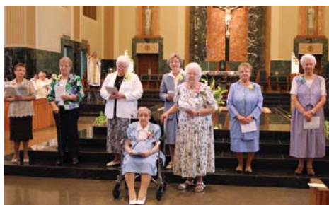
Jubilee Day was a joyful event for these celebrants.